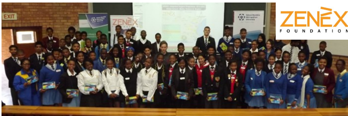
Learners attending the Winter School Programme at Missionvale campus