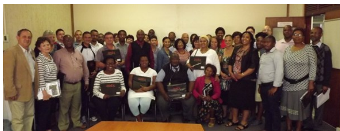
Initial introduction of project attended by Principals and Project co-ordinators from the 10 project schools

A Winter School Programme was held from 27 June to 01 July 2016 at the NMMU Missionvale campus to prepare learners for the second semester curriculum. Mathematics and Physical Science teachers participated in four Professional Learning Community (PLC) training sessions, while the Mathematics learners participated in afterschool TouchTutor® TAPS sessions facilitated by teachers from the schools. In 2017 the programme will be extended to include Grade 10 learners and will also provide support for Physical Sciences learners in the form of 6 four-hour Saturday sessions during the first three school terms and one 6 hour school holiday session during October.