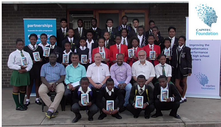
Learners on the Mthatha Maths and Science Incubator School Programme with their android tablets

The extension of the Maths and Science ITSP programme aims to help the Mthatha education community in secondary schools to experience quality offline technology-enhanced teaching and learning that is curriculum aligned and integrated with traditional teaching tools that are being used. Local leadership of the Department of Basic Education expressed their excitement and full support for this initiative and referred to the programme as "a very good and progressive initiative".