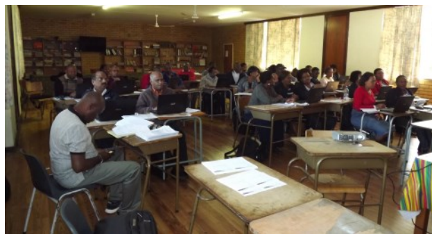
Professional Learning Community for Mathematics teachers

The Govan Mbeki Mathematics Development Unit would like to express our gratitude for the continued support of our generous funders.